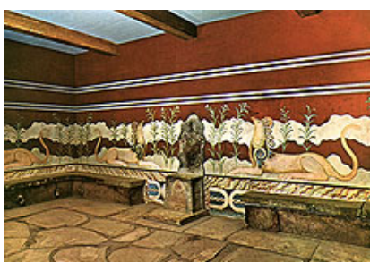
Photo of the King's throne room. The Minoan civilization predates even ancient Athens, which flourished after the 5 th century B.C. That makes Knossos as (one of) the earliest European sources of civilization, in fact, a very advanced one. Knossos had underground sewage systems with running water flowing through the Palace chambers before 3500 years ago... unfortunately, it served a blood thirsty spirit, and corrupted the early foundations of what later became the continent of Europe.