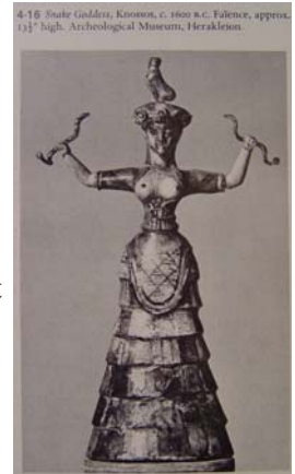
4-16 Snake Goddess, Knossos, c. 1600 B.C. Faience, approx. 13 1/2" high. Archaeological Museum, Heraklion

Kundalini is a serpent spirit, which was worshipped in Crete. The " snake-goddess " (official name of the statue) was one of the prominent local deities. The particular statue in the photo dates back to the 16 th century B.C., showing (most likely) a naked-breasted priestess holding snakes. I believe that it is a manifestation of the "Queen of Heaven". I also believe this is the same spirit that Yogi masters call Shakti, which resides in the lower spine. According to them, the purpose of yoga is to arouse the serpent powers of Shakti (Kundalini) so that she rises to the point of merging with Shiva. Shiva dwells at the center of the forehead. It is located between the two eyebrows (also known as the "Third Eye"). The person who accomplishes that union of Shakti and Shiva then possesses all power, psychic abilities, a liberated soul, and is unlimited by time and space!